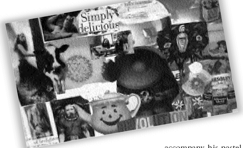
accompany his pastel Fig. II paintings of horses (Figs. V and VI):

He created collage after collage to represent who he was and his likes and dislikes. Each was stronger and more pertinent than the previous ones (Figs I -II). He experimented with clay (Fig. III). He threw himself on paper placed on the floor and had a friend outline his body so that he could represent his whole self as a Canadian (Fig.IV). And finally, choosing pastels, he created a number of pictures, filled with color and movement. Shyly, he told me that they wouldn't be complete without some written words. He was less reluctant to accept help, but just as determined to do it as much on his own as he could. He wrote the following poem to